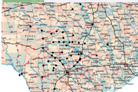
Sharpshooter Overwintering Trapping and Observation Sites