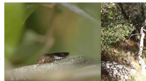
The Abundance of Live Oaks Probably Plays a Major Role in Winter Sharpshooter Survival in