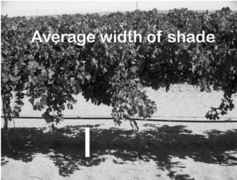
Figure 2. Estimating canopy shade with the use of a 4X4 board with 6 in. gridlines.